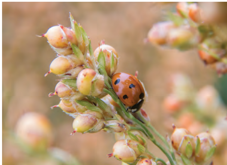
▲ BENEFICIAL INSECTS like lady bugs are critical to controlling sugarcane aphid populations.