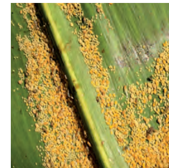
Infested sorghum leaf with all stages of sugarcane aphids present.

Avoid spraying pyrethroid insecticides, which are harmful to beneficial insects.