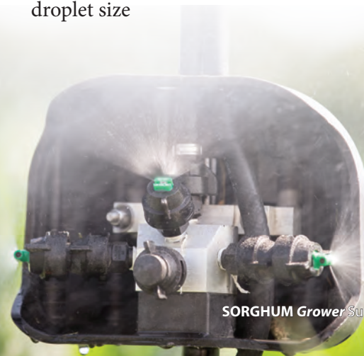
SORGHUM Grower Summer 2017