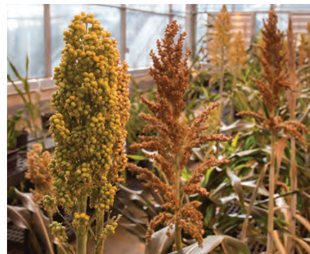
▲ RECENT INVESTMENTS by DOE and the Gates Foundation are putting sorghum back into Danforth Center greenhouses.

In 2016, the Bill & Melinda Gates Foundation awarded the Mockler lab a three-year $6.1 million grant to expand and accelerate the impact of the TERRA Phenotyping Reference Platform (REF) program to optimize breeding strategies for improving the yield and stress tolerance of sorghum bicolor as a critical source of nutrition for millions of people living in Sub-Saharan Africa.