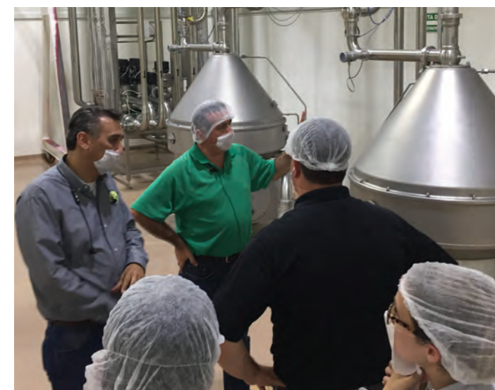
U.S. merchandisers and trade representatives visit Rancho Lucero in Durango, México.